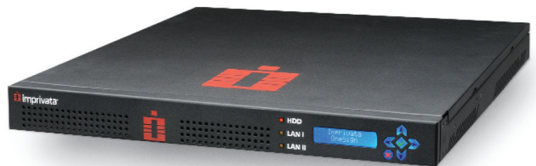
DIGIPASS BY VASCO