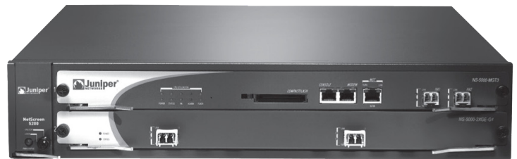
DIGIPASS BY VASCO